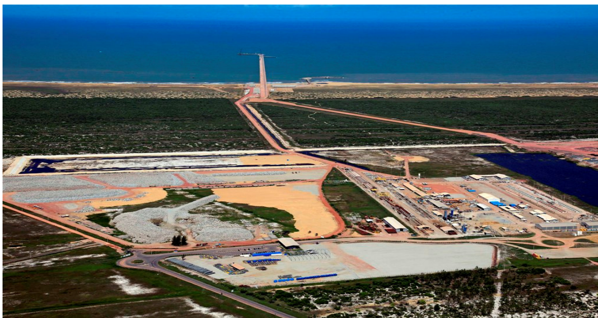
General view of the LLX Minas-Rio area at TX1