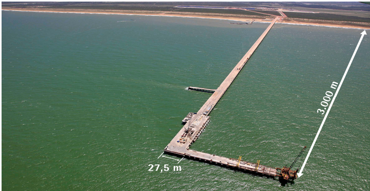
General view of access bridge (TX1)

In the 4th quarter of 2010, LLX Minas-Rio continued construction of the breakwater, which will be 1,300 metres by 925 metres ("L"-shaped) and is being built with stones from a leased quarry near to the Açú Superport. In addition to more than half a million m 3 of stones already produced, of which about 300,000 m 3 are stocked at Açú, 21,000 concrete "core-loc" structures (of which 13,000 have already been produced) comprise the last layers of the breakwater. At the end of this quarter more than 50% of the work on the iron-ore pier was completed and 16 million m 3 of material had already been dredged from the access channel and evolution basin, equivalent to about 90% of the total planned. Over 2,000 people, 75% of which from neighboring communities (São João da Barra and Campos) are working at the Superport site.