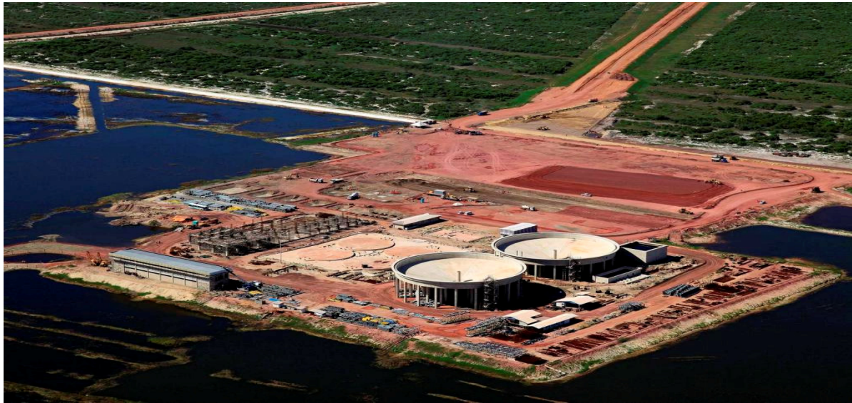
Iron ore stockyard and filtering area