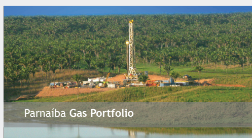
Parnaíba Gas Portfolio