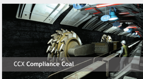
CCX Compliance Coal